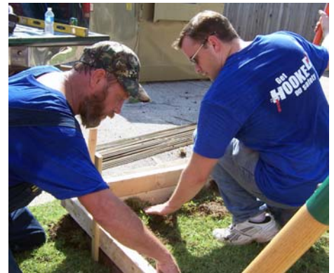
(Volunteers who poured a new concrete slab on this year's Day of Caring.)

year. TSHA is one of 61 area agencies that depends on United Way funds to continue serving our clients each year. The campaign will end on November 15. Please be as generous as you can.