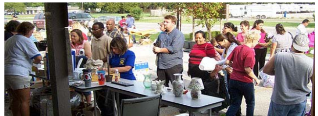
(There was a steady line of people all day at the pay table.)

TSHA's Rummage Sale 2010 brought in $1000 more than last year's, and the most ever! The total raised as of the third week in September was $2,403.17, compared to a final tally in 2009 of $1,538.00. We had some rain last year, but this year the weather was clear – although a bit TOO hot by the end of the day! A huge thank you to our many wonderful volunteers, donors, and shoppers – you made the sale a huge success. Proceeds go to TSHA's United Way campaign.