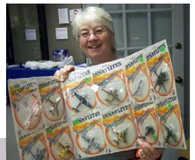
These are only a few of the items that will be in the silent auction.