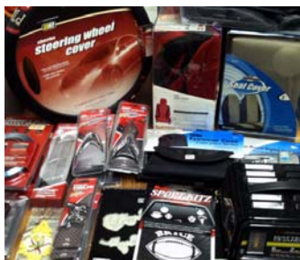
Silent Auction Items

Did you know you can make donations and renew your membership online at our website? Visit www.tsha.cc to find out more!