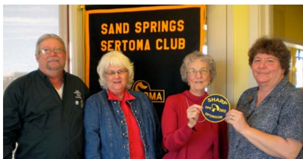
Three SHARP (Sertoma Hearing Aid Recycling Program) Board members presented a medallion to the Sand Springs Club in recognition of their donation. SHARP is a collaborative program between Sertoma and TSHA.